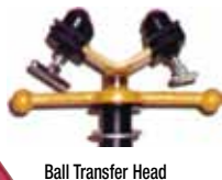
Ball Transfer Head

Supports full lengths of pipe, 1/2"-8", when using pipe threading machines