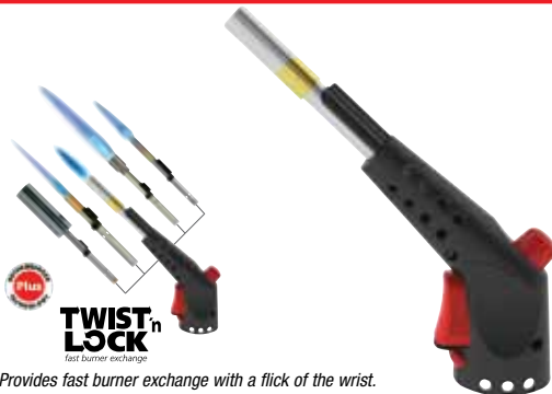
Provides fast burner exchange with a flick of the wrist.