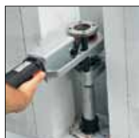
Fits into tight spaces