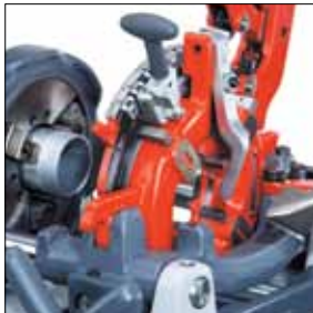
Automatic die head with quick adjustment of thread size, thread lengths and fine thread depths without recentering.

ROTHENBERGER's portable 2" threading machines offer fast and steady, precision threading, cutting, de-burring, and grooving. The powerful 750-watt (1 HP) motor provides strong turning power with consistent torque for swift, effortless production of accurate, standard pipe and bolt threads. The optional foldable, wheeled workbench makes transport easy, whether on site or in the workshop.