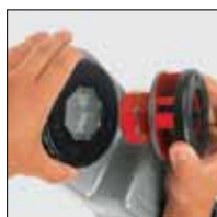
Inserting the die heads